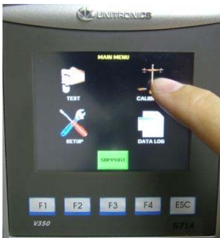
Navigate to Calibration screen