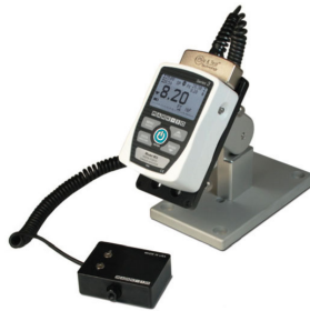
ST-FT1 is shown mounted to an optional tabletop stand with force sensor

The display also features an analog load bar for graphical representation of applied load, as well as set point indicators for pass-fail testing. USB output is provided for data collection purposes. The gauges include MESUR™ Lite data acquisition software. MESUR™ Lite tabulates continuous or single point data. One-click export to Excel allows for further data manipulation.