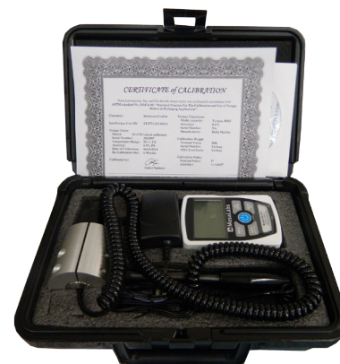
ST-FT1 complete with Calibrator Kit now available