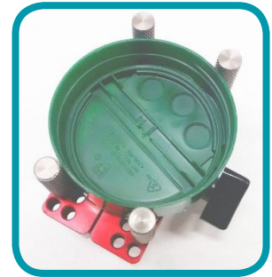
The universal chuck is compatible with most caps