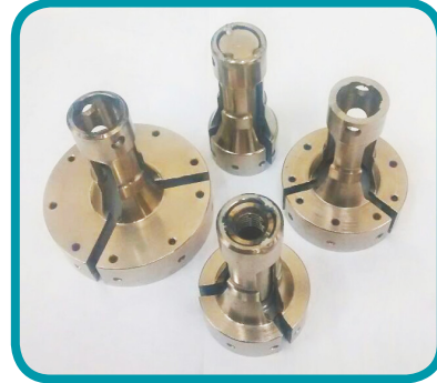
Varying cap sizes require multiple molded or serrated chucks