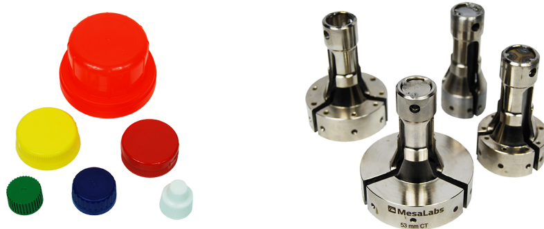
Varying cap sizes require multiple molded or serrated chucks

Historically, SureTorque machines incorporated a patented, air actuated chuck allowing the most convenient and automated cap gripping solution on the market. Unfortunately, custom molded collets can significantly increase the overall cost of the torque testing systems and complicate the changeover process. Recognizing the need for a lower cost and more universal tooling, Mesa Laboratories developed a manually actuated 4-post cap gripper.